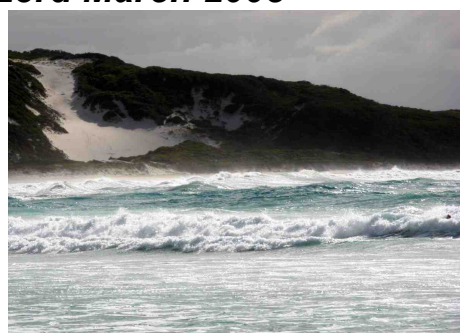
Denmark's Ocean Beach: 23 March 08

A decision was made very early that day to cancel the event due to unsafe conditions. The photo doesn't give the full picture. In fact the waves were breaking on the seaward side of the course.