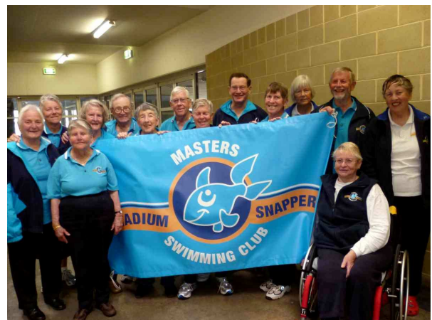
Some of the day swimmers showing off our new banner at afternoon tea, 10/09/10