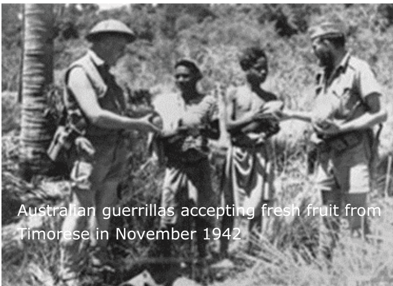
Australian guerrillas accepting fresh fruit from Timorese in November 1942