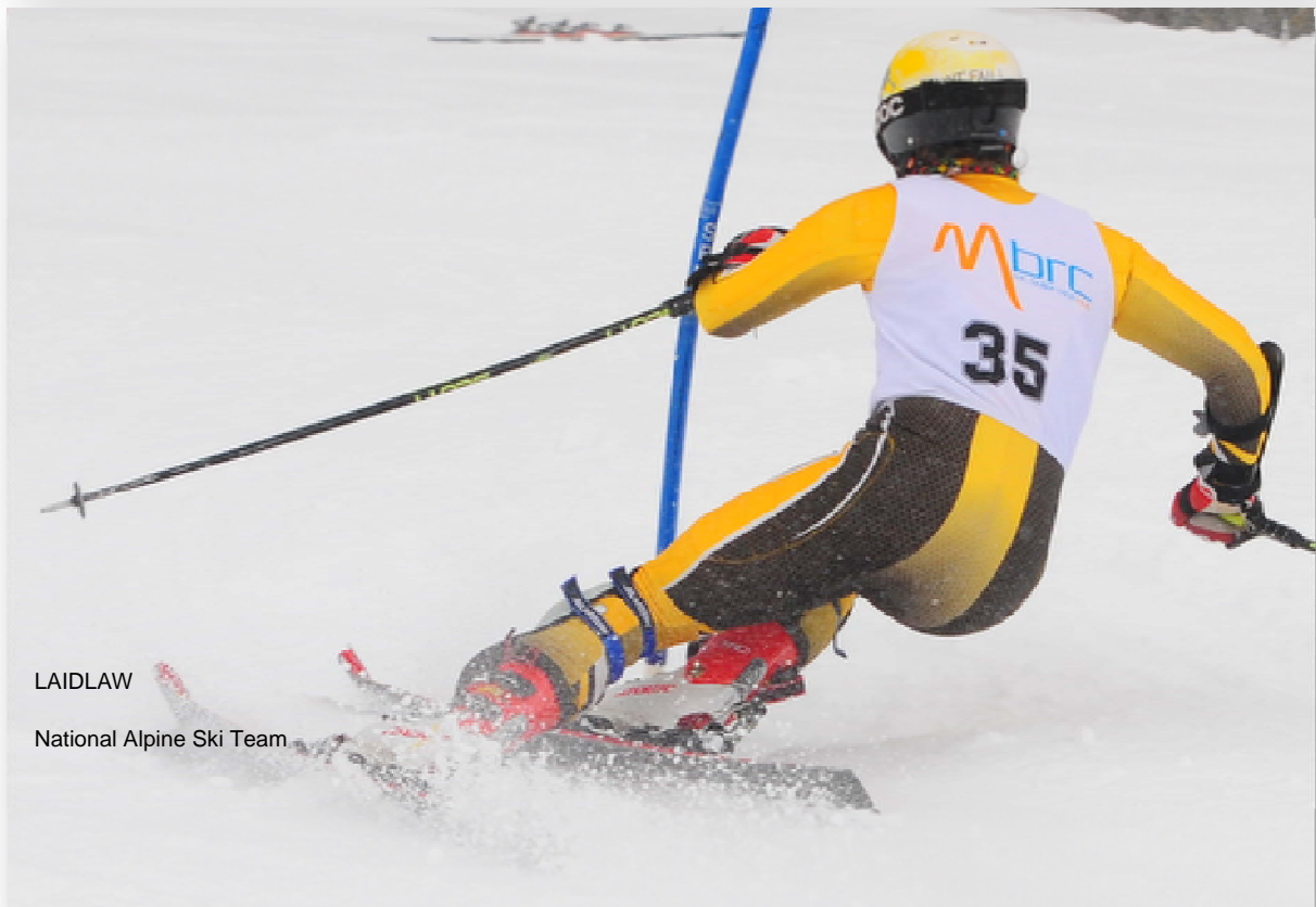
LIDLAW National Alpine Ski Team