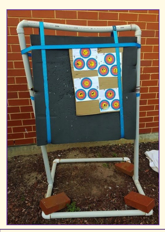
Ken Osborne's backyard butt

The cabling for our NBN connection has started with some initial cable runs being installed. A box still has to be located somewhere.