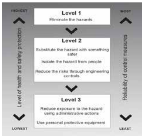
Figure 2: Hierarchy of risk control

The best way to correct a safety problem is to eliminate the hazard. If you can't eliminate the hazard, here is a list of options, starting with the best option: