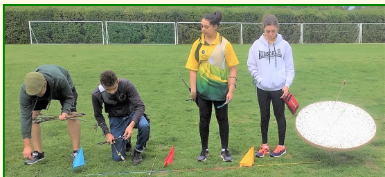
Sorting out the scoring arrows