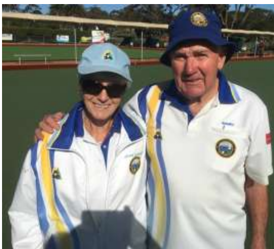
Mixed Pairs Champions 2018/2019