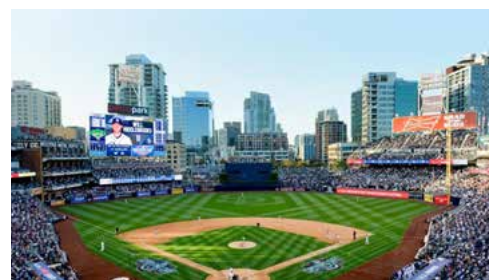
Petco Park, San Diego