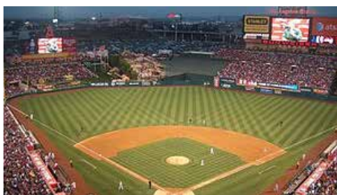
Angels Stadium, Anaheim