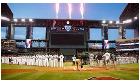
Chase Field, Phoenix, Arizona