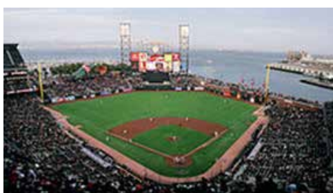
AT&T Park, San Francisco