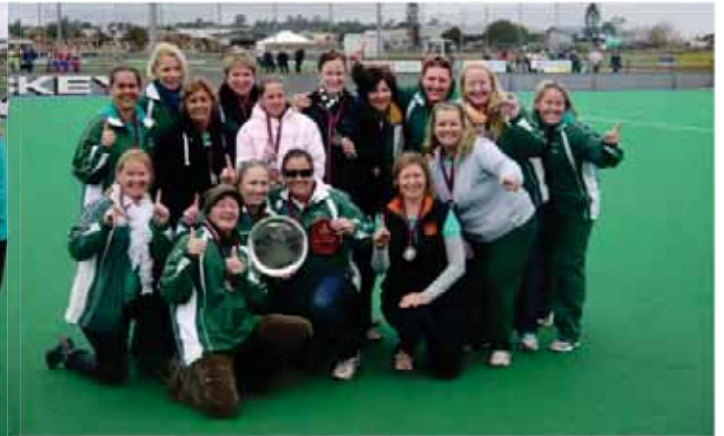
Division 4 Masters Women