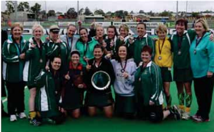
Division 1 Masters Women