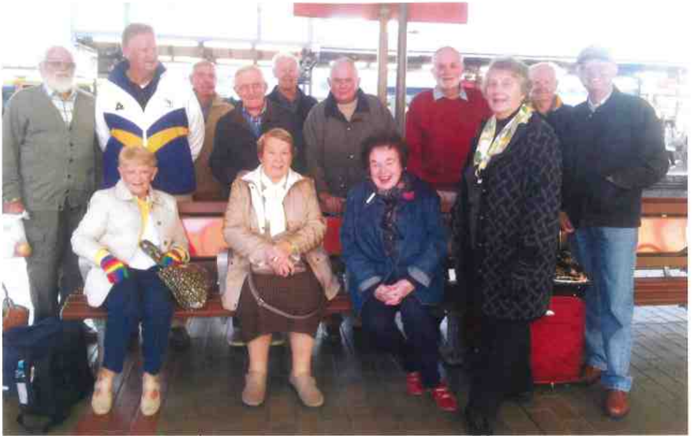
Hornsby Station – 7.15 am Thursday 28 th July - Freezing Cold – waiting for train to Casino, then bus to Cabarita Beach – a long day ahead.