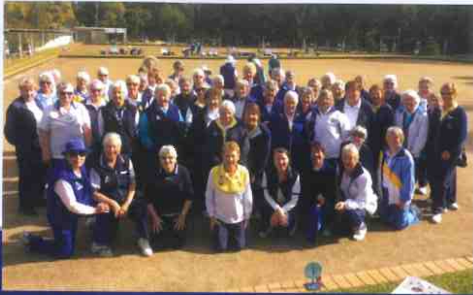
64 local ladies competed for the West Pymble Shield July 2016