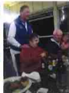
Sunday evening at the Mantra