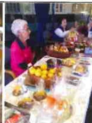
Winners of Turramurra Trophy – Pittwater WBC.