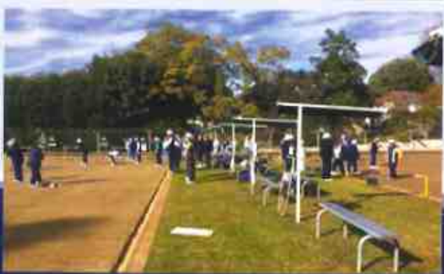
Everyone enjoyed playing for the West Pymble Shield. Turrumurra defended their championship title and once again took home the Shield. 4 July 2016