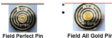
Field Perfect Pin

Field Perfect Pin: For a FITA Field Round where the 3 arrows on the one target are all in the 6 ring scoring 18 points. Both Medallions are available to purchase at club level.