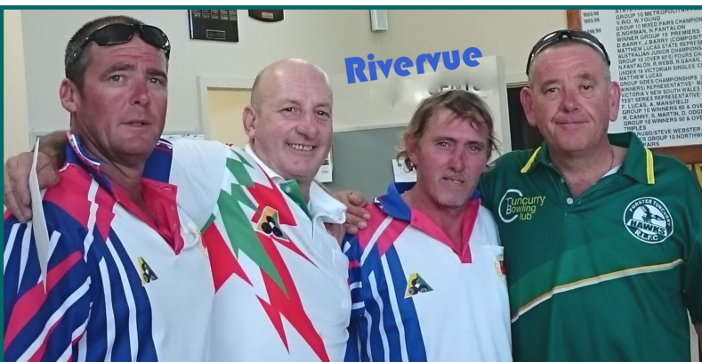
Third place winners - Our boys celebrate their big effort