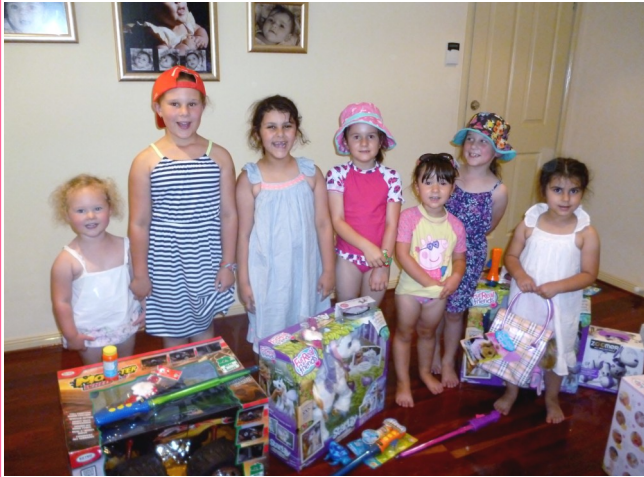
Joe is so passionate about his magnificent 7.

“If the group reached 15 grandchildren all girls, then a few eyebrows might be raised but the chance of that is still low enough (1 in about 32,000).” Now think of your winning Tattsлото chances. ( one million to one? )