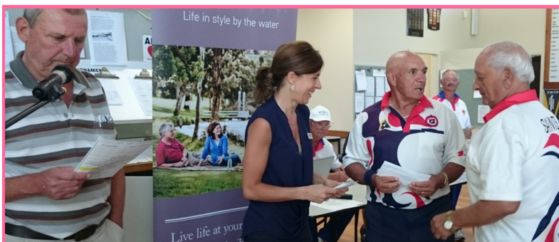
Best 3rd game - Our neighbours from St. Albans B.C. make it up to the winner's circle