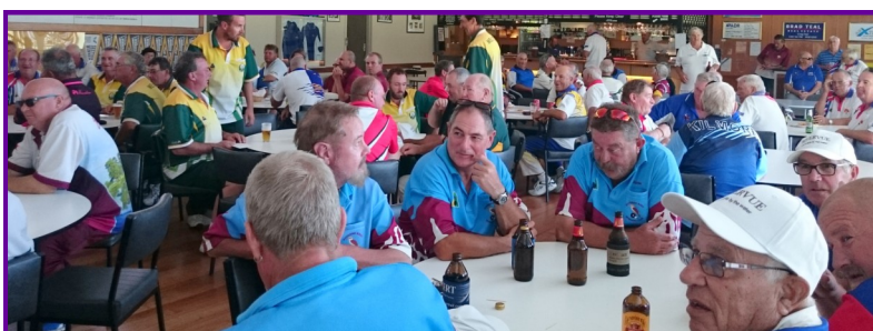
The crowd has a sensational day