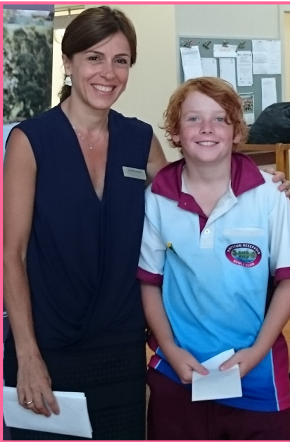
Congratulations go to the youngest winner