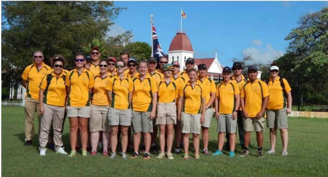
Team Australia in front of the Royal Palace.