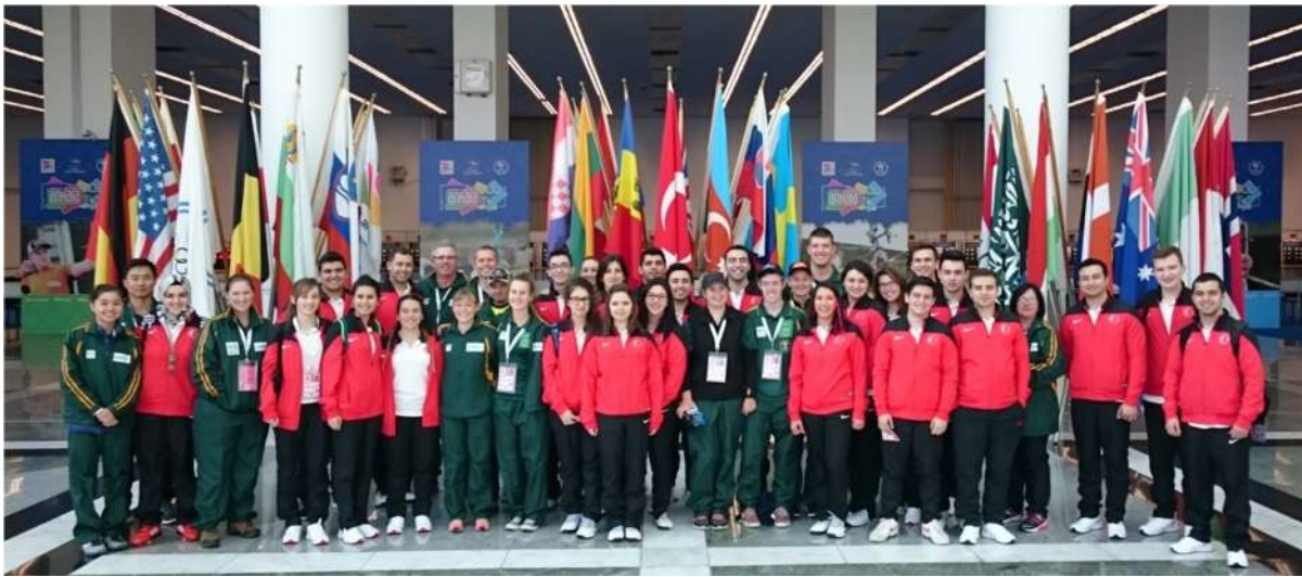
Australian and Turkish Team photo