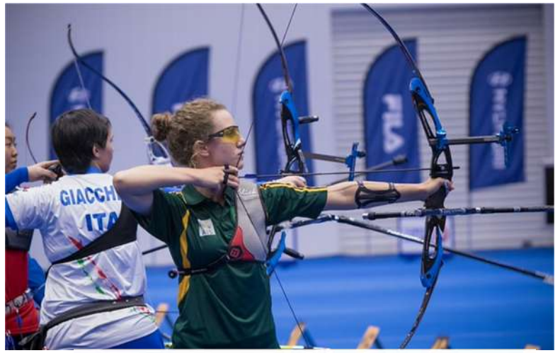
Clare shooting in the team's match play against Italy