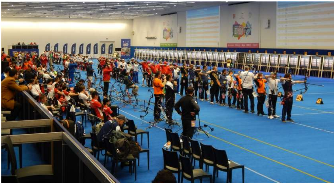
Competition Hall – recurve lanes 1-25, compound lanes 26-50