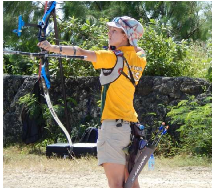
Clare shooting for Gold.