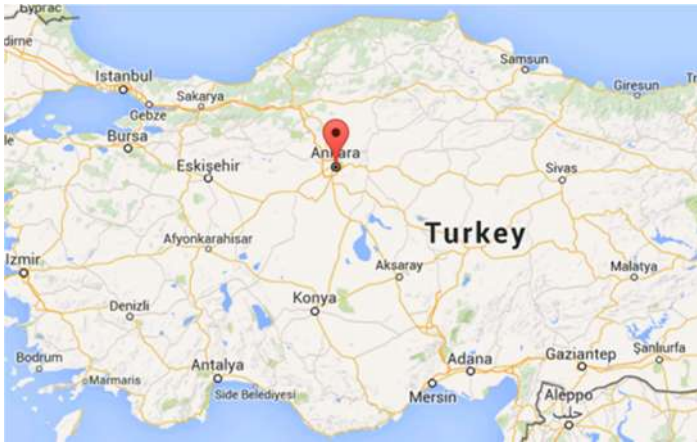
So exactly where is Ankara? Approximately 45 minute flight time from Istanbul