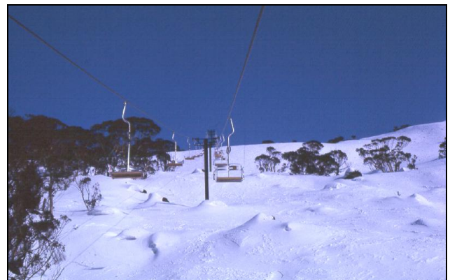
Ramshead Chairlift above Thredbo's "Rock Garden"

Vertical rise: 1,500 ft; Length: 5,290 ft; Average rope gradient: 28.4%; Rope diameter: 1.25 in; Number of chairs: 135; Travel time: 10 minutes; Normal speed: 9.2 ft/sec; Chair type: 2-seater; Chair spacing: 82 ft; Capacity: 800 passengers/hour; Main motor (electric): 120 hp; Auxiliary motor (petrol): 56 hp.