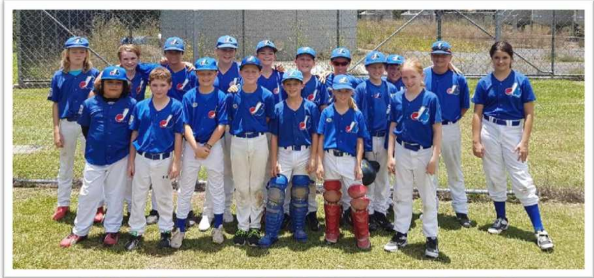
Little League Bandits Red & Blue teams after their last qualifying game 9/12/17